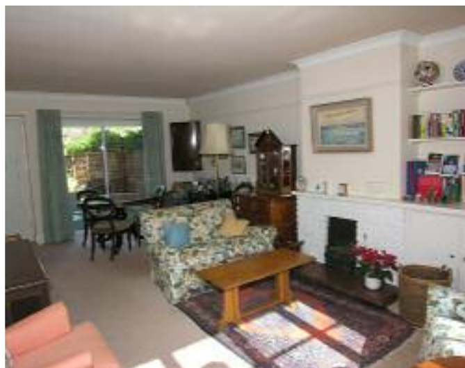
Two double panelled radiators, secondary glazed window and brick fireplace with tiled hearth.

12' 11" (3.94m) widening to 15' 4" (4.67m) x 22' 5" (6.83m)