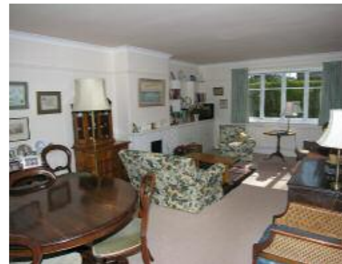
Double glazed sliding patio door to rear garden, low-level cupboards with book shelving above and picture rail.