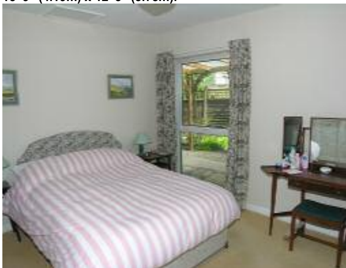
Fitted double wardrobe with louvered doors and cupboards

above. uPVC double glazed picture window to skirting level and double glazed window. Double panel radiator.